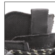
Double tongue for excellent pressure distribution and adjustment