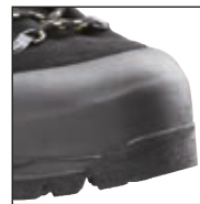
Rubber toe and heel protection